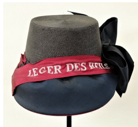
An officer’s Salvation Army bonnet (20th century, The Netherlands, TRC 2020.3332a)

Before Covid-19 turned the world upside down the TRC Leiden was in discussion with the Bijbels (Bible) Museum, Amsterdam, about a group of objects they were de-accessioning. They were reorganising their whole structure and way of working and numerous items were looking for new homes, including a variety of textiles and garments.