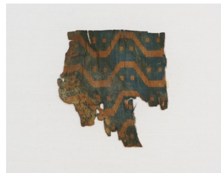
Small fragment of Jin silk from Niya, Xinjiang, western China, ca. 100 AD (TRC 2000.0009).

Yet another resource is the five-part video, now on YouTube, of the V&A's stunning exhibit Kimono: Kyoto to Catwalk .