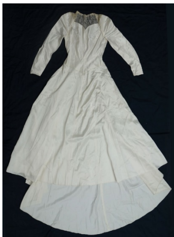
American wedding dress, 1942 (TRC 2020.2126).