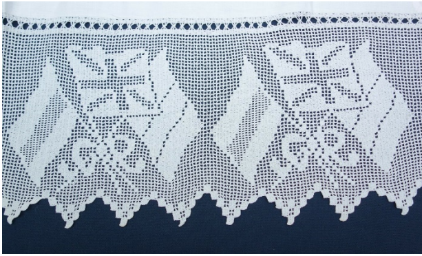
Tablecloth with a crochet border depicting the flags of Britain, France and Belgium (c. 1914-1917, TRC 2020.3744).

It turned out the tablecloth is a patriotic item dating to the First World War. More specifically, the border of the cloth had a design of the British, French and Belgium flags, which suggests that it was created prior to the arrival of the Americans in the First World War, so between 1914-1917.