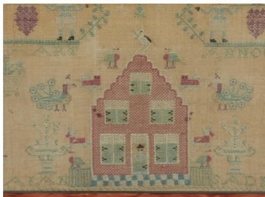
Detail from a sampler dating to the late 18 th century (TRC 2020.3683)

There are a total of six samplers that date from between the mid-eighteenth century and 1803 (TRC 2020.3682- 3687). They all have linen grounds and are worked in polychrome silk yarns, most of which have now faded. In addition, some of the black yarns have bled leaving heavy stains.