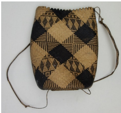
A hand-woven raffia basket from Congo ( TRC 2020.5076 ).