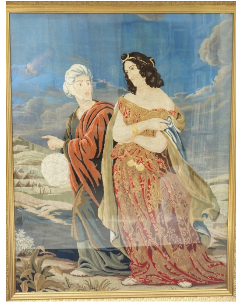
A 19th century embroidered picture (TRC 2020.3320)

One panel is especially large (135 x 105 cm) and depicts a lady in a low cut, ornate dress with an elderly woman carrying a white bag (TRC 2020.3320). The woman is pointing to a city on a hill top and a series of tents just below the city walls.