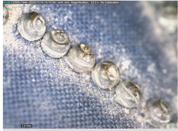
Image of a series of hand made, wrapped pin heads on a pin cushion dated 1826, magnification 33.2x (TRC 2020.4732a).

Pin cushions decorated in this manner were fashionable from the early 18th to the late 19th century and are often associated with a birthday and/or a marriage. It is believed that this particular pin cushion was owned by a member of the Blanken family, who lived in the Gouda region of the Netherlands. Exactly who owned it has yet to be determined, but the fact that there are two sets of initials suggests it was made to celebrate a marriage.