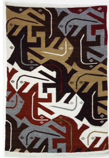
A wall hanging with a woven design of Escher's 'Reptiles' (mid-20th century, TRC 2020.3742).