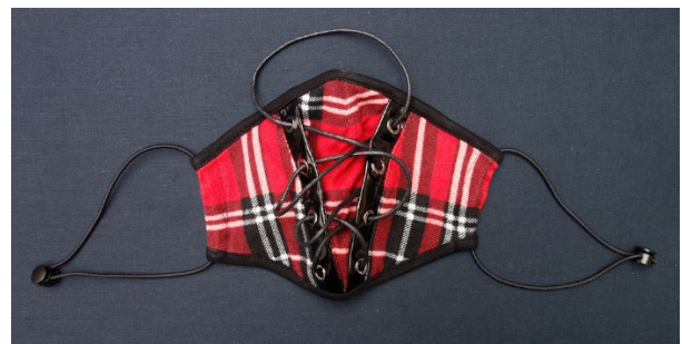
Tartan face mask with lacing for the Gothic/Punk market, China/UK, 2020 (TRC 2020.3997).