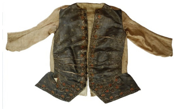
An 18th century man's waistcoat (TRC 2020.0879).

The waistcoat is of interest for various reasons, structurally, decoration-wise, as well as for the indications it gives about the original owner's economic means!