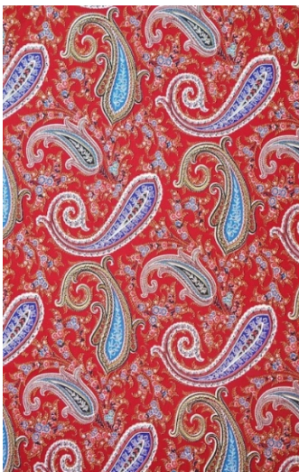
Modern example of Tissu Provençal with the paisley motif, ca. 2020 (TRC 2020.3192).

The online programme includes a series of presentations, video documentaries, guided tours, a round table discussion, with participants using chat boxes to ask questions after each session. The