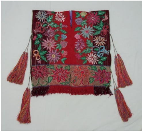
An embroidered woman's top from Mexico (TRC 2020.0531).