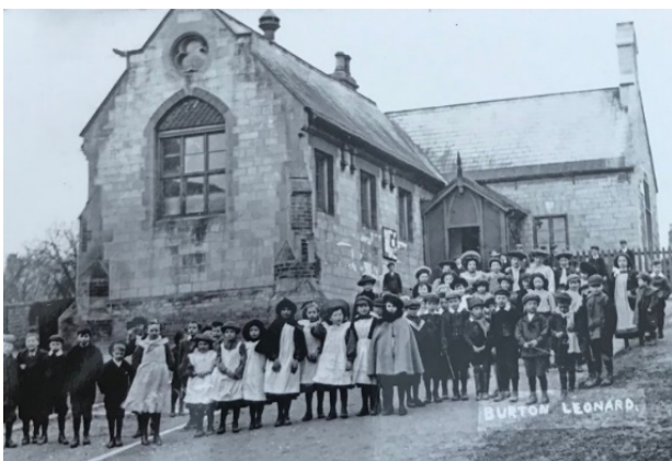
Children in front of the Burton Leonard school (c. 1900. Postcard, Burton Leonard School).