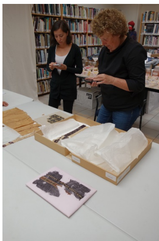
Examining archaeological textiles from Egypt, at the September 2020 edition of the five-day TRC Intensive Textile Course.

With the knowledge gained during the spinning and weaving workshops, we were soon able to identify various textiles from the inexhaustible collection of the TRC (with a little help from Gillian). Then we were introduced into the different printing techniques. So many possibilities, and so many ways to combine various techniques. Unbelievable.