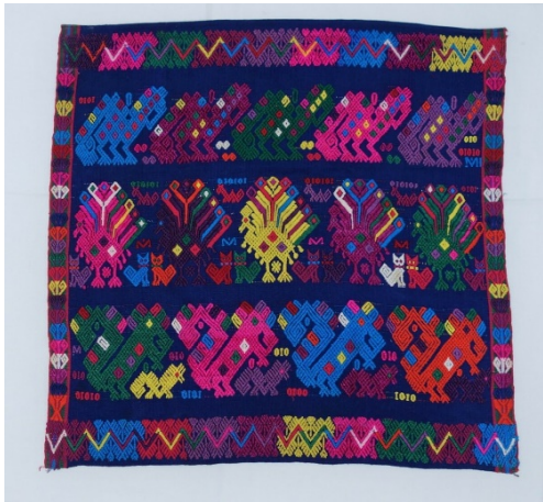
A woven, man's cloth from Guatemala (Santo Domingo Xenacoj; TRC 2019.2851).