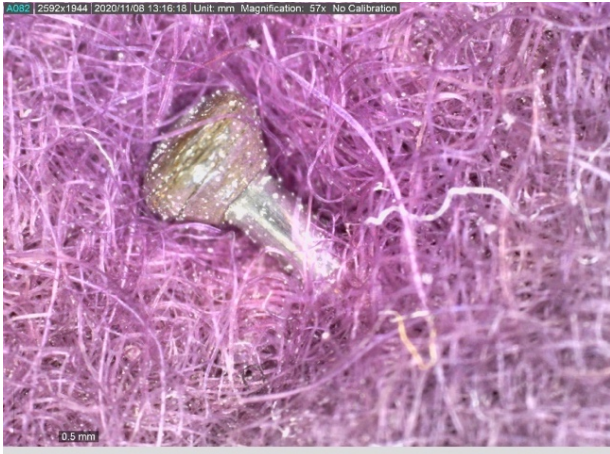
Detail of the hand made, wrapped pin head on an alleged broadcloth fragment of Napoleon's pall, magnification 57x (TRC 2020.4528).

Under the Dino-lite microscope (57x magnification) the pin that was made to fasten the piece of cloth to the accompanying piece of paper turned out to be handmade and produced using two different pieces, the shank and the head.