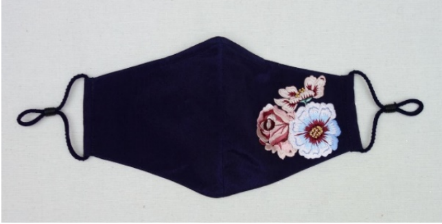
A corona face mask donated by the London based company of Hand&Lock ( TRC 2020.5176a ).