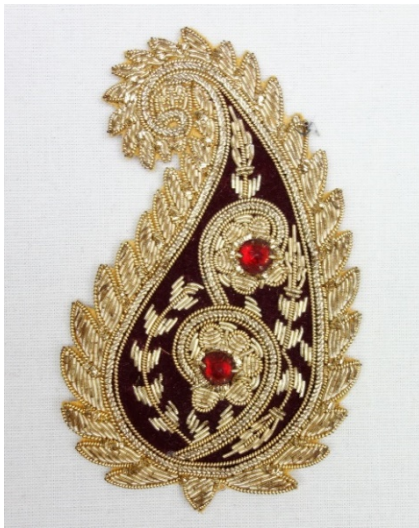
A paisley (butah) motif from India ( TRC 2020.5154 ).