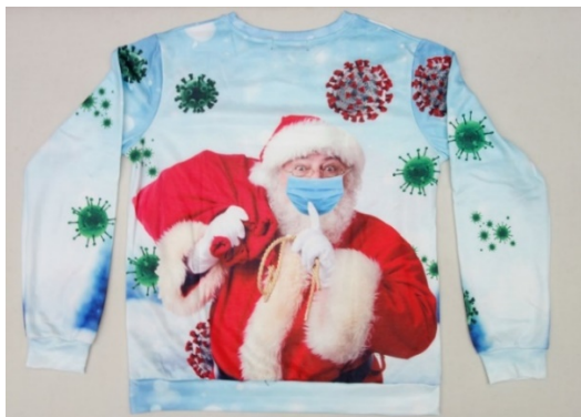
An 'orrible Christmas jumper with a corona theme (2020; TRC 2020.5178)

This included our participation in the long-awaited national Textile Festival of May 2020. We had planned a week of activities based on the theme of quilting. In addition, a conference that had been organised with IIAS, Leiden and Tracing Patterns Foundation , Berkeley, California (October) has had to be indefinitely postponed. Although as an alternative we did have four-days of online lectures, films and various question times (see below).