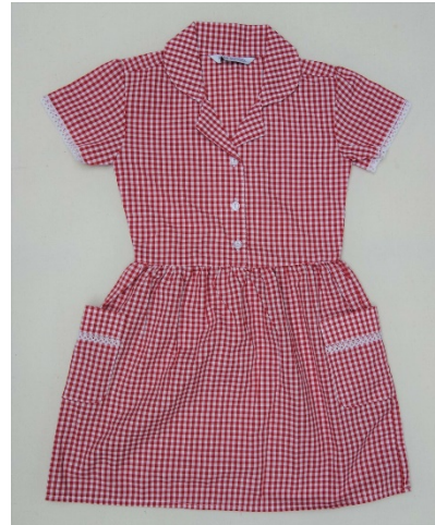
A gingham school uniform dress from the Burton Leonard Church of England School (c. 2020; TRC 2020.3704).