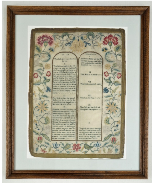
An 18th century silk embroidered sampler (England, TRC 2020.3317).

The items include several 18th century samplers, notably a beautiful example (TRC 2020.3317) that dates to 1737 and has a central design of two stone tablets with the Ten Commandments (in English, and with embroidered corrections of the spelling), which are surrounded by embroidered flowers in silk.