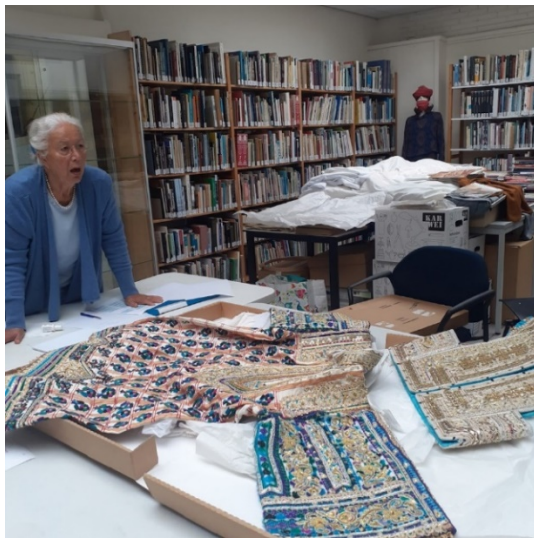
TRC workshop on 25th July: Middle Eastern embroidery.