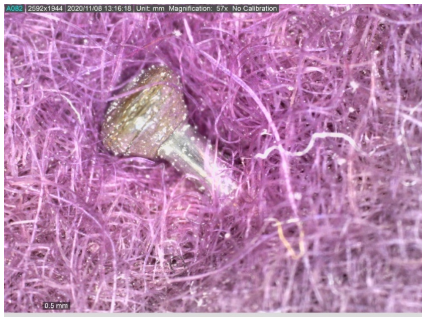
Detail of the hand-made pin at 57x magnification, on the 1840 pall of Napoleon Bonaparte (TRC 2020.4528).

Textile Research Centre Hogewoerd 164 2311 HW Leiden, The Netherlands