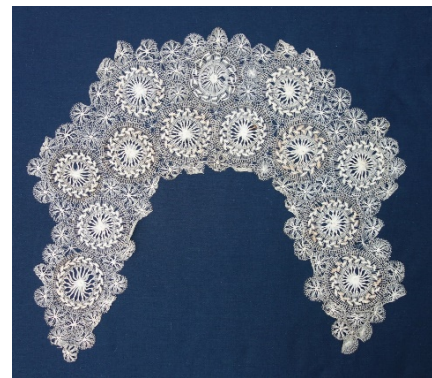
A Tenerife lace collar (early 20th century, TRC 2020.0462).

A cotton, linen or silk thread is passed back-and-forward around the 'teeth', nails or pins that are inserted into the edge of the frame. Once all these 'radical' threads are secured a pattern can then be woven using a needle. The finished discs (rosettes) are then released from the frame. Once enough lace discs have been made they are sewn together in an open structure, or may be inset into a ground material. Sometimes the ground material is also embroidered.