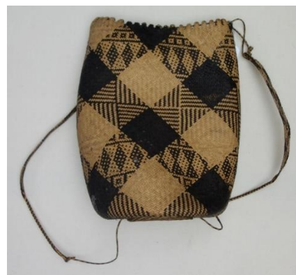
A hand-woven raffia basket from Congo ( TRC 2020.5076 ).