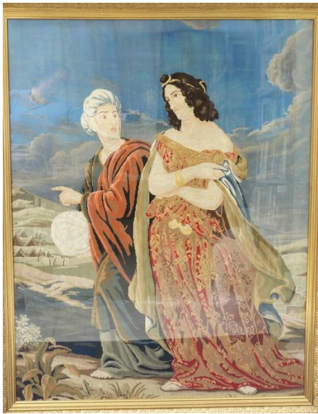
A 19th century embroidered picture (TRC 2020.3320)

The other sampler dates to 1793 (TRC 2020.3321) and depicts a range of plants, animals, birds and the image of two men carrying a large bunch of grapes (King James version, Numbers 13:23: “And they came unto the brook of Eshcol, and cut down from thence a branch with one cluster of grapes, and they bare it between two upon a staff; and they brought of the pomegranates, and of the figs.”).