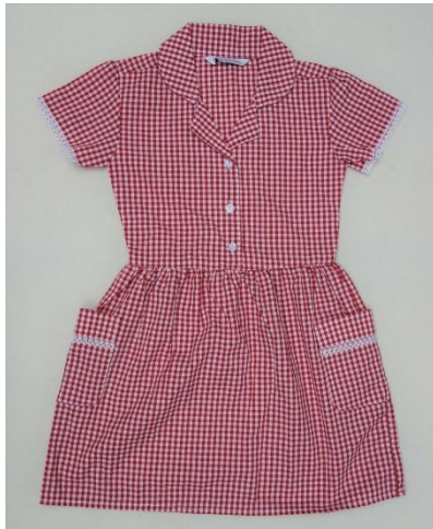
A gingham school uniform dress from the Burton Leonard Church of England School (c. 2020; TRC 2020.3704 ).