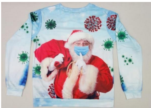
An 'orrible Christmas jumper with a corona theme (2020; TRC 2020.5178 )

This included our participation in the long-awaited national Textile Festival of May 2020. We had planned a week of activities based on the theme of quilting. In addition, a conference that had been organised with IIAS, Leiden and Tracing Patterns Foundation , Berkeley, California (October) has had to be indefinitely postponed. Although as an alternative we did have four-days of online lectures, films and various question times (see below).