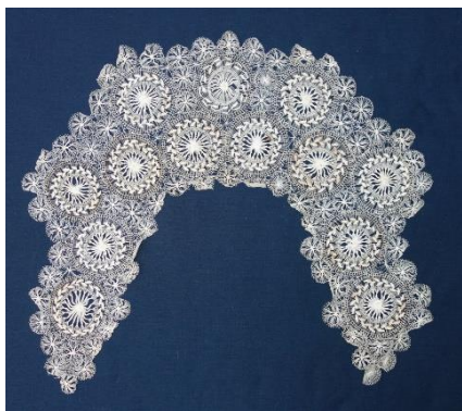
A Tenerife lace collar (early 20th century, TRC 2020.0462 ).

A cotton, linen or silk thread is passed back-and-forward around the ‘teeth’, nails or pins that are inserted into the edge of the frame. Once all these ‘radical’ threads are secured a pattern can then be woven using a needle. The finished discs (rosettes) are then released from the frame. Once enough lace discs have been made they are sewn together in an open structure, or may be inset into a ground material. Sometimes the ground material is also embroidered.