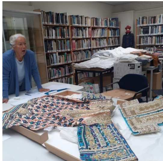
TRC workshop on 25th July: Middle Eastern embroidery.