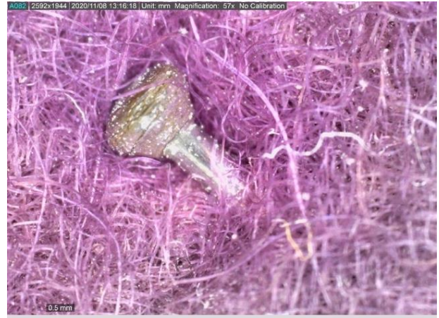
Detail of the hand made, wrapped pin head on an alleged broadcloth fragment of Napoleon's pall, magnification 57x ( TRC 2020.4528 ).