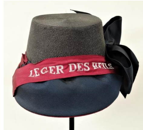
An officer's Salvation Army bonnet (20th century, The Netherlands, TRC 2020.3332a )

Before Covid-19 turned the world upside down the TRC Leiden was in discussion with the Bijbels (Bible) Museum, Amsterdam, about a group of objects they were de-accessioning. They were reorganising their whole structure and way of working and numerous items were looking for new homes, including a variety of textiles and garments.