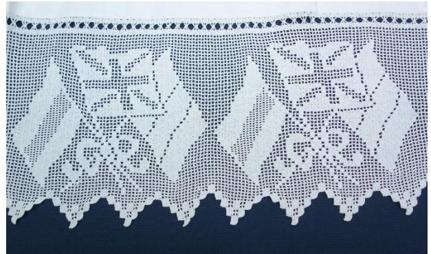
Tablecloth with a crochet border depicting the flags of Britain, France and Belgium (c. 1914-1917, TRC 2020.3744 ).