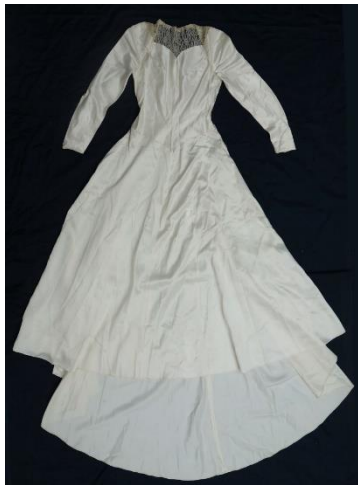
American wedding dress, 1942 ( TRC 2020.2126 ).