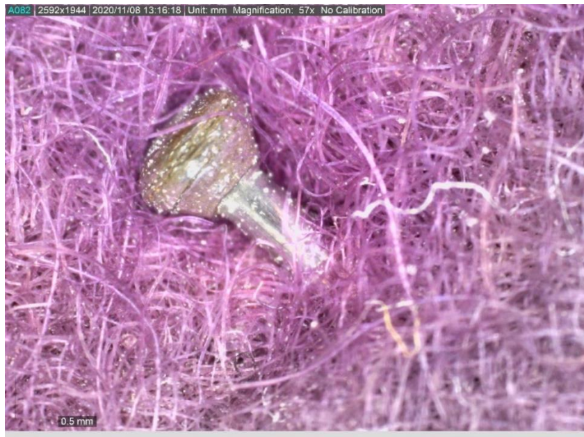
Detail of the hand-made pin at 57x magnification ( TRC 2020.4528 ).

Textile Research Centre Hogewoerd 164 2311 HW Leiden, The Netherlands