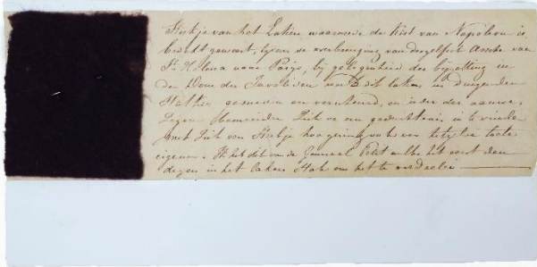
Fragment of broadcloth (to the left), purportedly cut from a pall of Napoleon's coffin in 1840/1841. To the right is a piece of paper with a text in Dutch identifying the piece of cloth ( TRC 2020.4528 ).

coffin. The cloth was allegedly used when Napoleon's remains were transported back from St. Helena in the southern Atlantic (his place of exile from 1815 until his death in 1821) to France, on board the frigate La Belle Poule. This occurred in the second half of 1840, and Napoleon's remains were eventually laid to rest in the Dôme des Invalides in Paris.