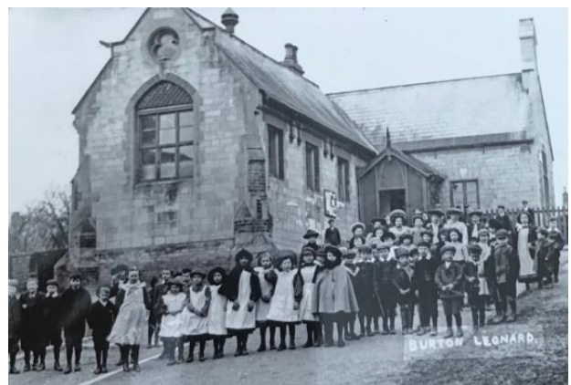
Children in front of the Burton Leonard school (c. 1900. Postcard, Burton Leonard School).