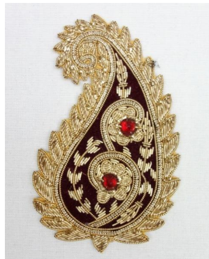
A paisley (buteh) motif from India ( TRC 2020.5154 ).