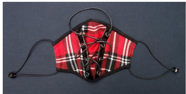
Tartan face mask with lacing for the Gothic/Punk market, China/UK, 2020 ( TRC 2020.3997 ).