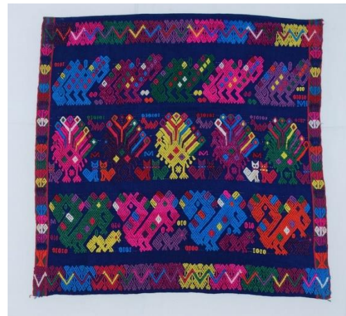
A woven, man's cloth from Guatemala (Santo Domingo Xenacoj; TRC 2019.2851 ).