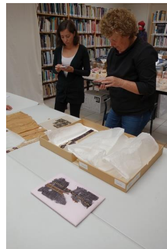
Examining archaeological textiles from Egypt, at the September 2020 edition of the five-day TRC Intensive Textile Course.

With the knowledge gained during the spinning and weaving workshops, we were soon able to identify various textiles from the inexhaustible collection of the TRC (with a little help from Gillian). Then we were introduced into the different printing techniques. So many possibilities, and so many ways to combine various techniques. Unbelievable.