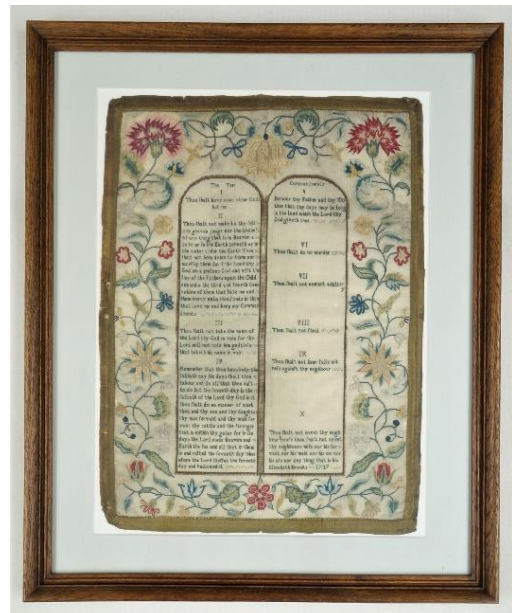
An 18th century silk embroidered sampler (England, TRC 2020.3317 ).

Before Covid-19 turned the world upside down the TRC Leiden was in discussion with the Bijbels (Bible) Museum, Amsterdam, about a group of objects they were de-accessioning. They were reorganising their whole structure and way of working and numerous items were looking for new homes, including a variety of textiles and garments.