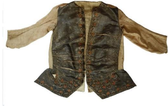
An 18th century man's waistcoat ( TRC 2020.0879 ).

The waistcoat is of interest for various reasons, structurally, decoration-wise, as well as for the indications it gives about the original owner's economic means!