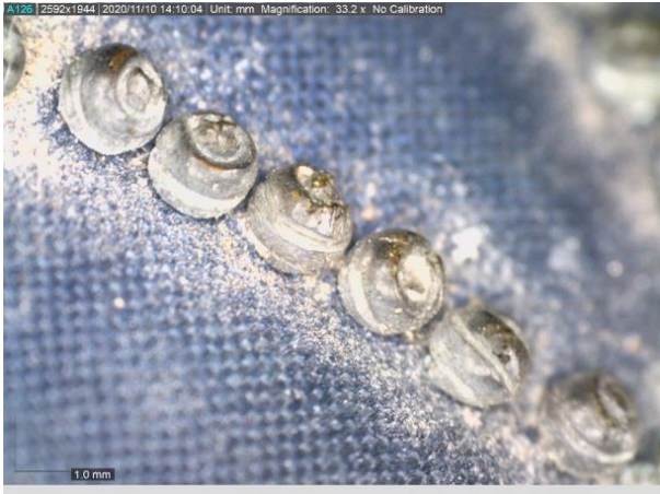
Image of a series of hand made, wrapped pin heads on a pin cushion dated 1826, magnification 33.2x ( TRC 2020.4732a ).

The pins used to make the initials and the date all have spherical heads. The pins were hand made, using a shank made from steel that was then coated with nickel. The pin's head was made from a narrow length of flattened wire (plate) that was wrapped three to five times around itself and attached to the blunt end of the shank.