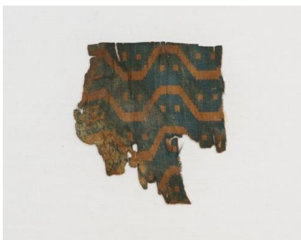
Small fragment of Jin silk from Niya, Xinjiang, western China, ca. 100 AD (TRC 2000.0009 ).

Yet another resource is the five-part video , now on YouTube, of the V&A's stunning exhibit Kimono: Kyoto to Catwalk .