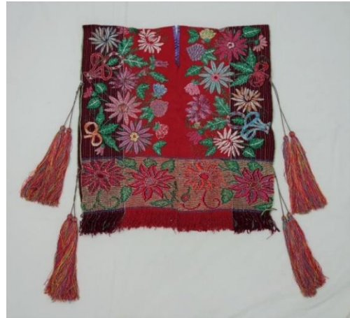
An embroidered woman's top from Mexico ( TRC 2020.0531 ).

They include a wide range of patterns that show the diversity of colour combinations, motifs and symbolism regarded as suitable for these garments. It is our plan to display many of these garments in an (actual) exhibition in the autumn of 2021, but this all depends on what happens with the corona pandemic. There will, of course, be an online version of the exhibition!