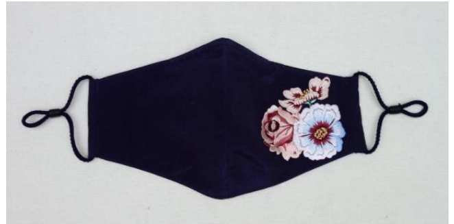
A corona face mask donated by the London based company of Hand&Lock ( TRC 2020.5176a ).