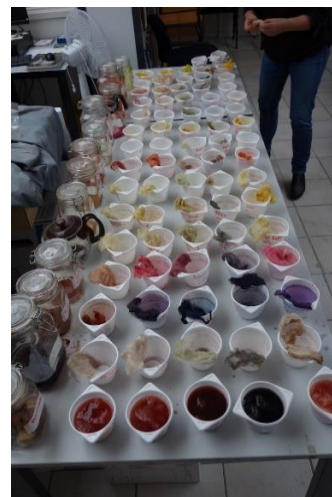
About sixty different dye baths made from natural dyes, producing a plethora of colours, at the September 2020 edition of the five-day TRC Intensive Textile Course.

The course is suitable for anyone dealing with archaeological, historical and modern textiles, for designers and fashion students, as well as anyone who is seriously interested in all aspects of textile history and production, and simply wants to know and practise more.