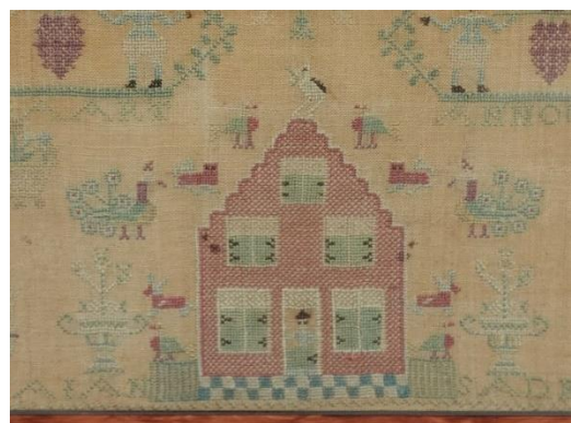
Detail from a sampler dating to the late 18 th century ( TRC 2020.3683 )

There are a total of six samplers that date from between the mid-eighteenth century and 1803 (TRC 2020.3682- 3687). They all have linen grounds and are worked in polychrome silk yarns, most of which have now faded. In addition, some of the black yarns have bled leaving heavy stains.