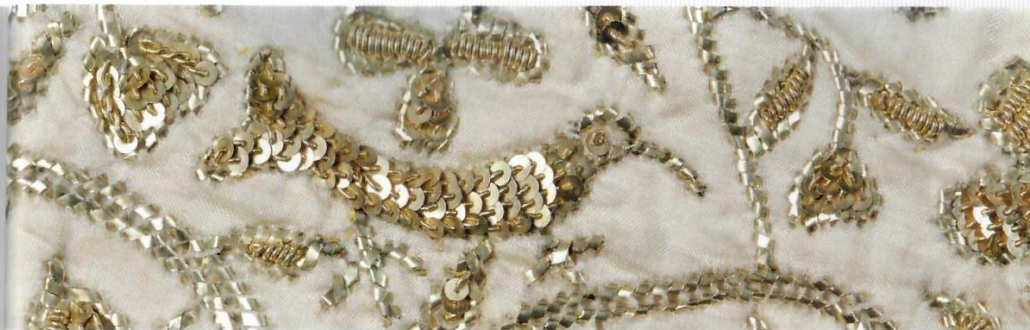
Detail of a Tunisian embroidery (early 20th century)